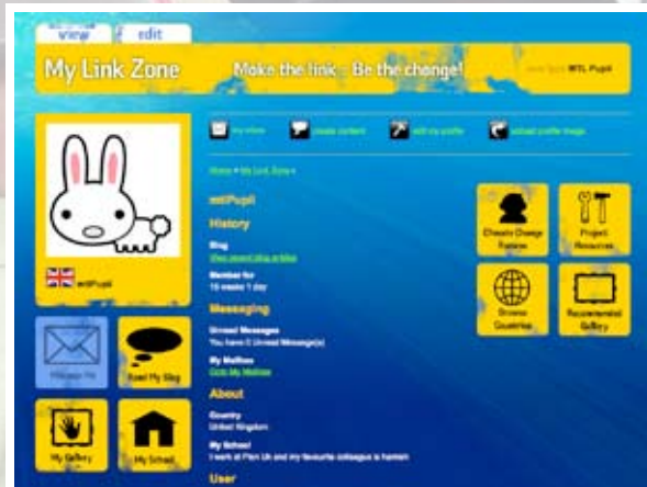
Student profile page on project website