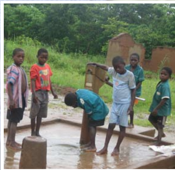
Children involved in the project in Malawi