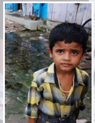
Child in Plan community in Bangladesh during floods