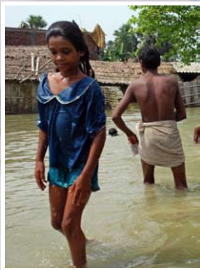
Girl from a Plan community in Bangladesh