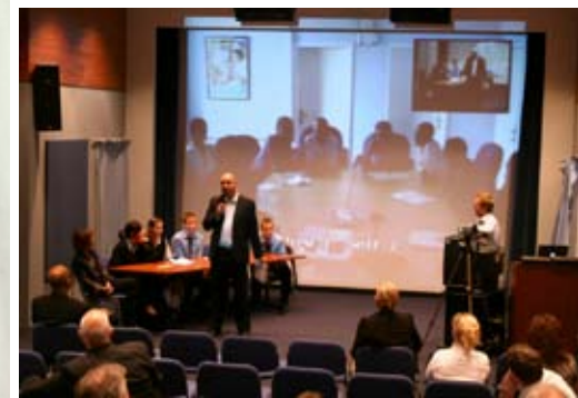
UK / Sierra Leone Video Conference